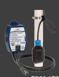
TSC2 / TSC3