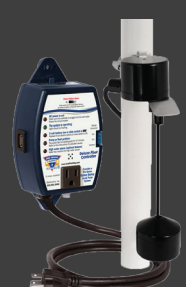
VSC2 / VSC3