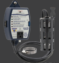
DFC2 / DFC3