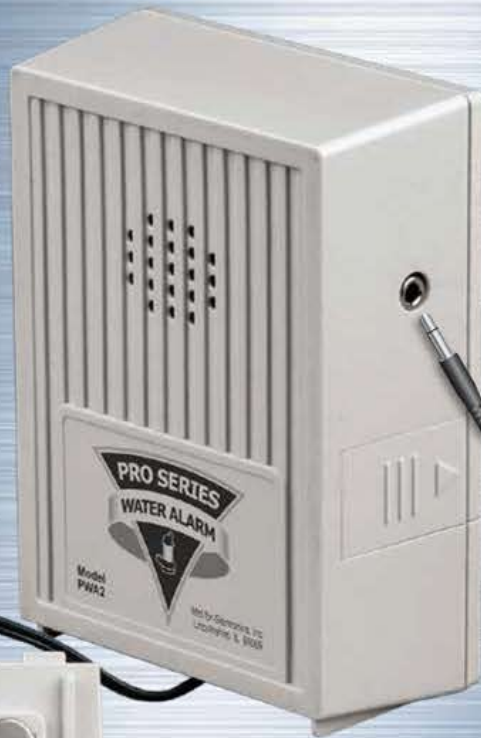
Model No. PWA2