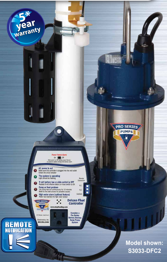
Model shown: S3033-DFC2