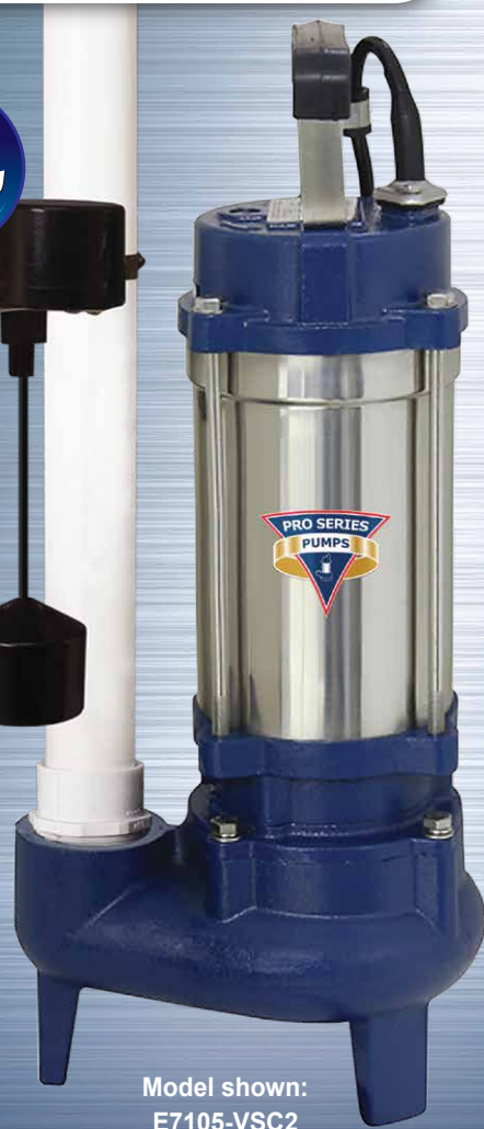
Model shown: E7105-VSC2