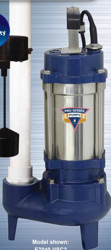
Model shown: E7040-VSC2