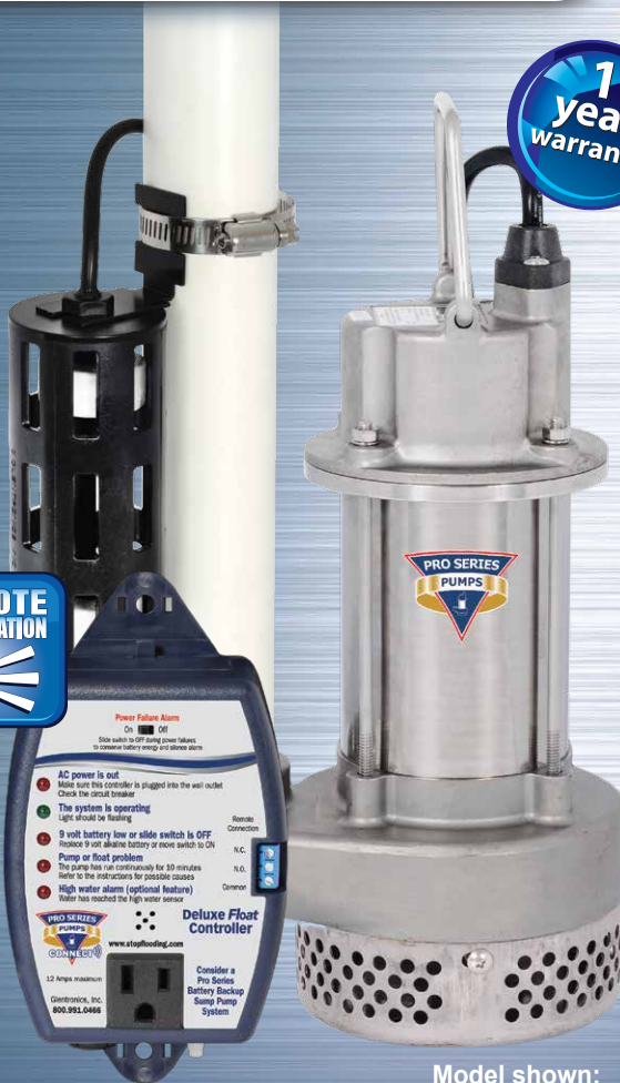
Model shown: C8100-DFC2