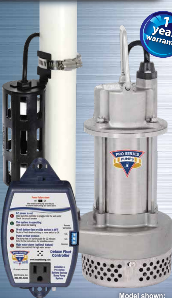
Model shown: C8050-DFC2