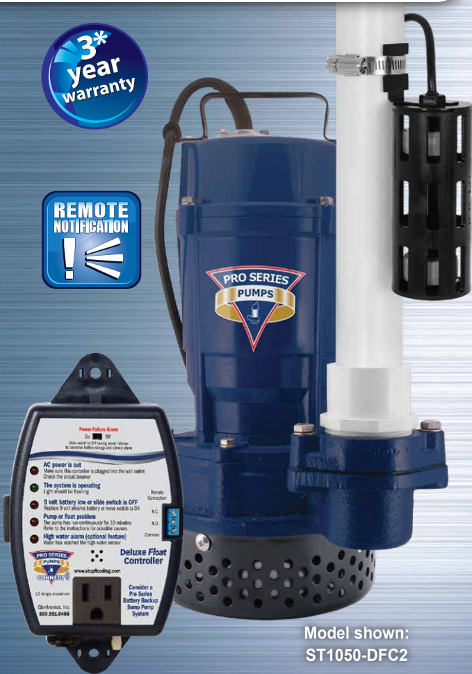
Model shown: ST1050-DFC2